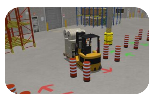
Driving in reverse with tall loads