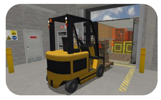
Placing mixed types of loads into a box truck at the loading dock