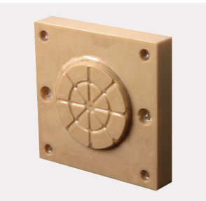
Figure 3: The PEEK sheet conforms to the part's shape while smoothing its surfac