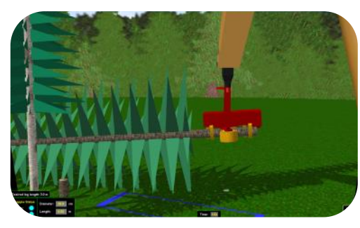
Mastering the basics of the complete Cut-To-Length cycle