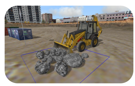
Dumping material on dumping zone with loader bucket