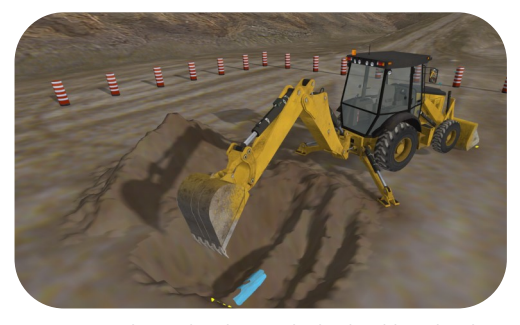
Exposing a buried utility with the backhoe bucket