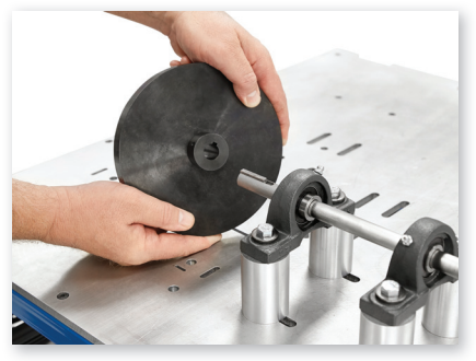
Hands-On Skills with Real-World Equipment