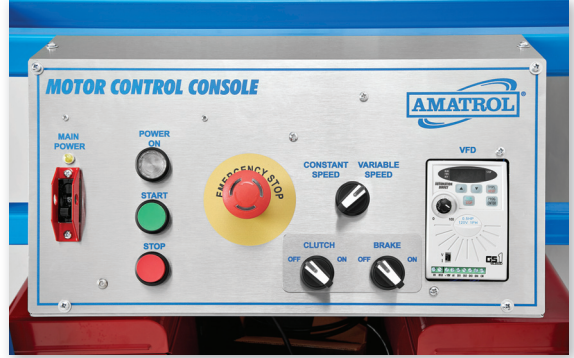
The 97-ME4 adds clutch and brake switches to the Motor Control Console.

The 97-ME4 features real-world, industrial-quality brake and clutch components, including a 24V DC Model ERS-42 brake with splined hub and a cam clutch. Users will learn about the operation and applications of multiple types of brakes and clutches. They will also gain hands-on skills, such as calculating the torque created by an inertial load and installing and adjusting an electromagnetic brake and cam clutch.