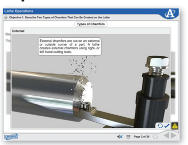
96-MP3 Multimedia Showing Types of Chamfers in Lathe Operation

In addition to the knowledge and skills presented in this learning system, Amatrol offers even more Machine Tools training! Machine Tools 3 (96-MP3) focuses on the manual lathe through topics like: roughing and finishing operations, cutting chamfers, grooving operations, and threading operations.