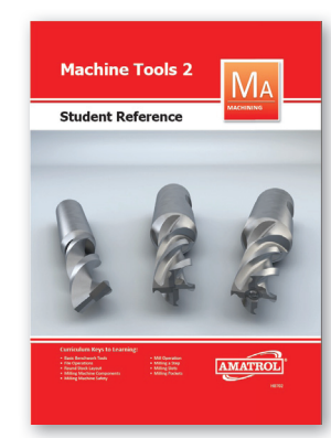
Student Reference Guide