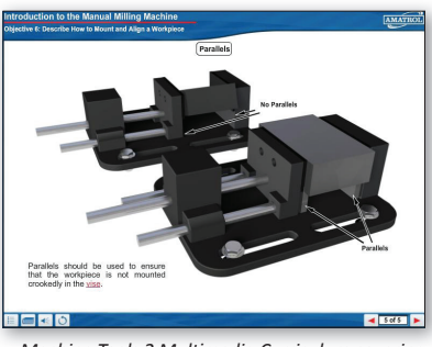
Machine Tools 2 Multimedia Curriculum covering Manual Milling Machines

In addition to the knowledge and skills presented in this learning system, Amatrol offers expansion courses to further your Machine Tools training. Machine Tools 2 (96-MP2) covers topics like bench vises, hacksaws, files, and the manual milling machine, and Machine Tools 3 (96-MP3) focusses solely on the manual lathe through topics like: roughing and finishing operations, cutting chamfers, grooving operations, and threading operations.