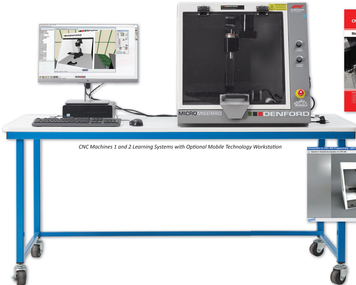
CNC Machines 1 and 2 Learning Systems with Optional Mobile Technology Workstation