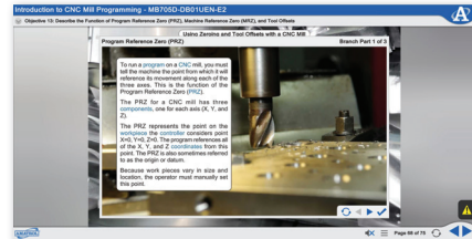
Interactive Multimedia Curriculum

Using the 96-CNC1D's Denford Micromill, CNC Machines 2 includes end mills and a stub drill bit. Learners will use these components to practice industry-applicable skills like designing CNC programs that use a pecking cycle, a boring cycle, subprograms, cutter compensation, and mirroring. Other topics discussed in this course include spindle speed, feed rate, and cycle time optimization.