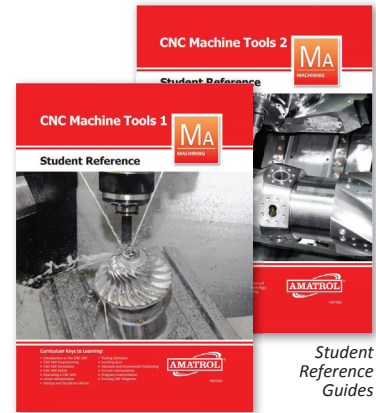
Student Reference Guides