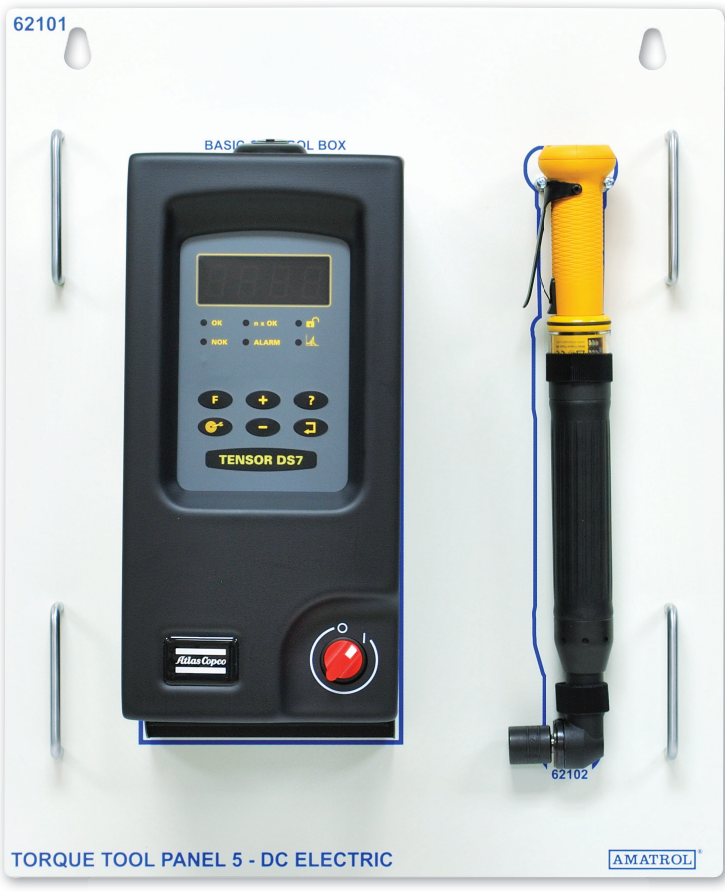
Instrumented DC-Electric Torque Wrench Learning System (95-PAS5)