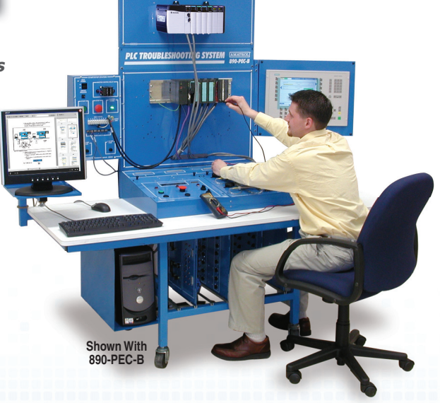
eBooks Support Hands-On Skill Training