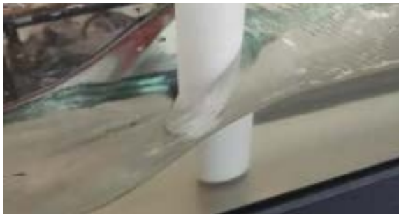
SUBCRITICAL AND CRITICAL FLOW PAST A PIER