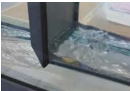
FLOW UNDER A SLUICE GATE