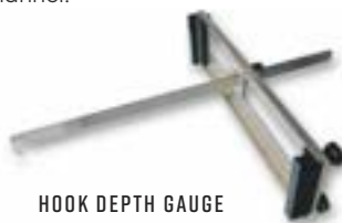
HOOK DEPTH GAUGE