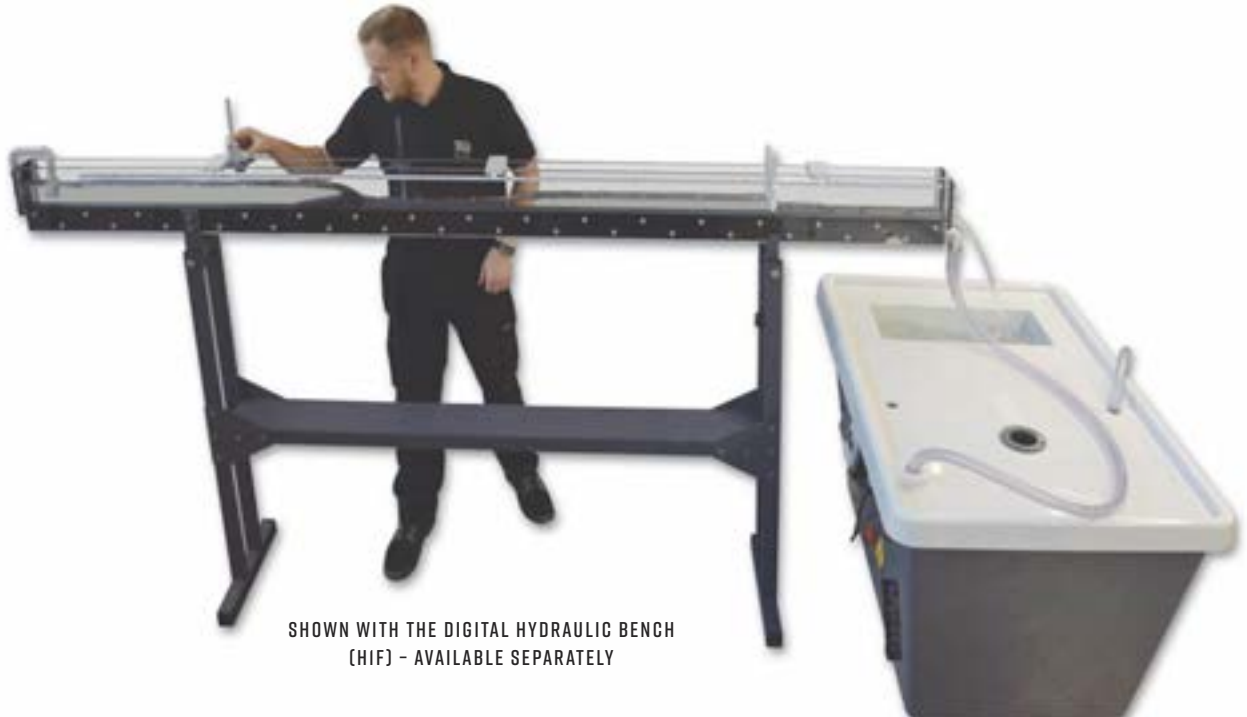
SHOWN WITH THE DIGITAL HYDRAULIC BENCH (H1F) - AVAILABLE SEPARATELY

Demonstrates flow around weirs and other objects in an open channel. Supplied with all the models and instrumentation required for a complete package in flow channel investigations.