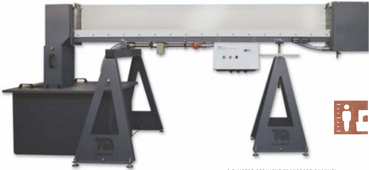
2.5-METRE SEDIMENT TRANSPORT CHANNEL

Open channel flumes that provide students with the ability to study the varying effects of sediment transport, bedform dynamics and fluid flow in an open channel.