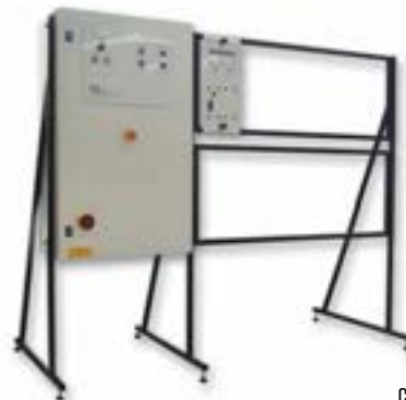
FC300 CONTROL BOX AND INSTRUMENT FRAME (SHOWN WITH VDAS ® - INCLUDED)