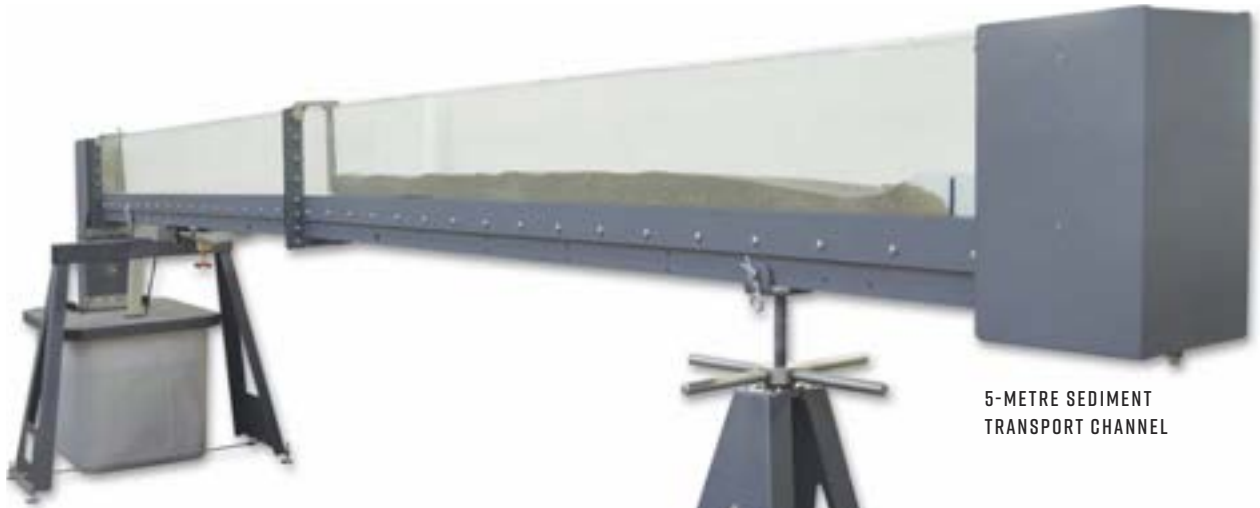
5-METRE SEDIMENT TRANSPORT CHANNEL