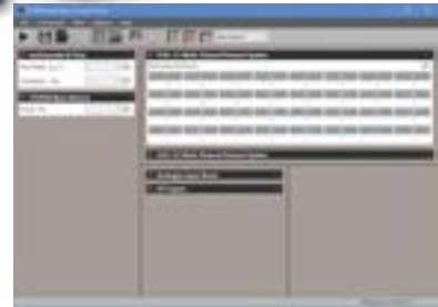
SCREENSHOT OF THE VDAS ® SOFTWARE