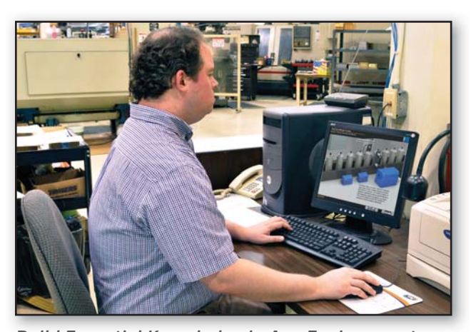
Build Essential Knowledge in Any Environment