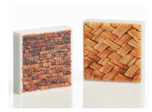
GrabCAD Voxel Print expands the limits of conventional CAD applications. These texture tiles show the exact-match color mapping ability of the brick and wicker patterns to their original sources.

The cancellous bone model demonstrates the ability to replicate complex anatomical structures using GrabCAD Voxel Print. This utility lets medical professionals create models that offer greater realism when practicing procedures like cutting, reaming and drilling, with a performance unobtainable by other modeling methods.