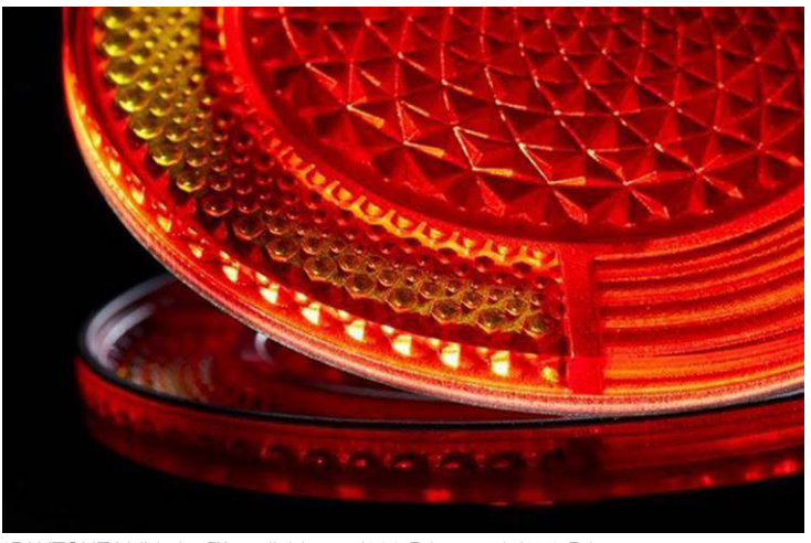
*PANTONE Validation™ available on J826 Prime and J850 Prime